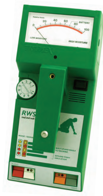
Product order code: RWS

The Tramex RWS is a multi-mode non-invasive impedance moisture scanner designed for the instant, precise and non-destructive evaluation of moisture conditions and leak tracing in the roofing and walls systems of the building envelope.