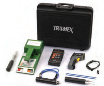
Product order code: EIK5.1

The RWS (a combination of the Leak Seeker and Wet Wall Detector) is available in the Exterior Insulation and Finishing Systems Inspection Kit for moisture detection and evaluation of walls and EIFS. This kit contains: the RWS (and aluminum telescopic handle for roof use), the MRH III for moisture condition readings in a variety of wall materials, a Hygro-i® probe for ambient relative humidity readings, wood Pin-probes and hole-punch, and an infrared surface thermometer. Comes in a rugged foam-lined carry case.