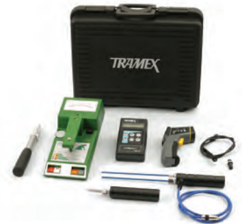
Product order code: RIK5.1

The RWS is available in the Roof Inspection Kit for moisture detection and evaluation of roofing and waterproofing systems. This kit contains: the RWS (and aluminum telescopic handle for roof use), the CMEX II for moisture content readings in concrete, a Hygro-i® probe for ambient relative humidity readings, wood Pin-probes and hole-punch, and an infrared surface thermometer. Comes in a rugged foam-lined carry case.